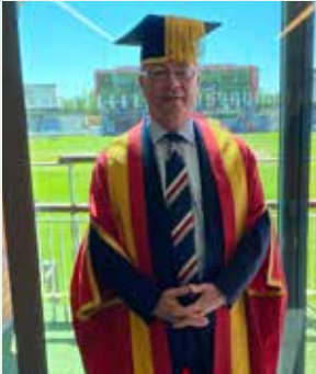
ALISTAIR BURT Bury, 1983–1997; North East Bedfordshire, 2001–2019

We asked a selection of ex-colleagues to say what they have been doing since they stood down or lost their seats