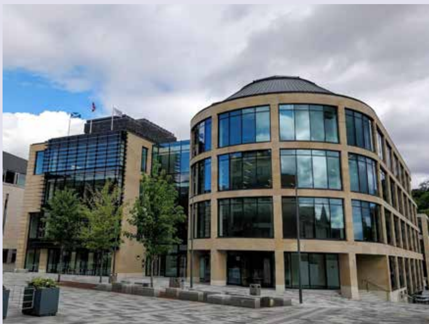
Queen Elizabeth House